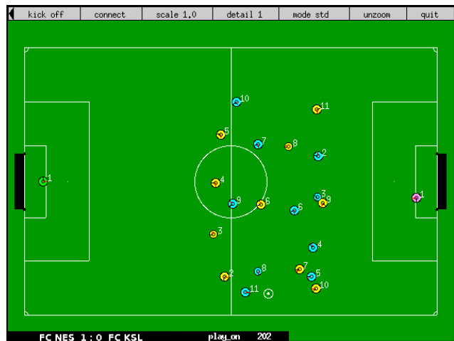
Figure 2: Team evaluation using soccer simulator

The success of genetically evolved ANNs used in [3] for autonomous mobile robot control shows a good potential